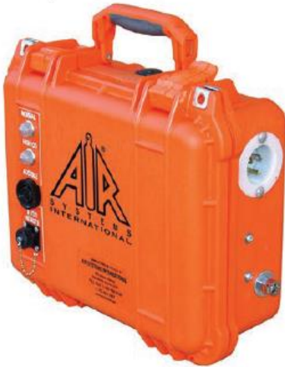
Portable CO Monitor CO91-14LAC