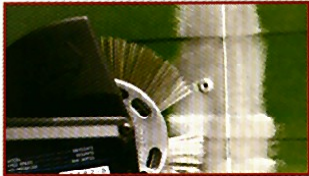
Cleans without damaging healthy material