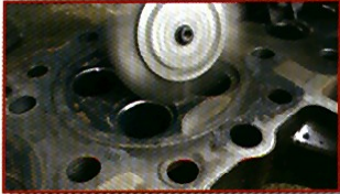
Performs on contours, uneven surfaces and edges