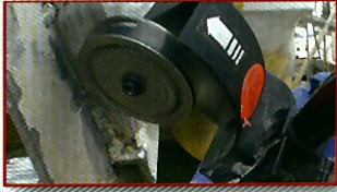
Strips unwanted residue and profiles surface