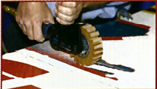
Easily removes vinyl, tape and adhesives