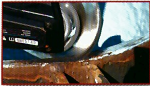
Quickly removes corrosion and coatings