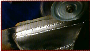
Removes hard or soft material without clogging